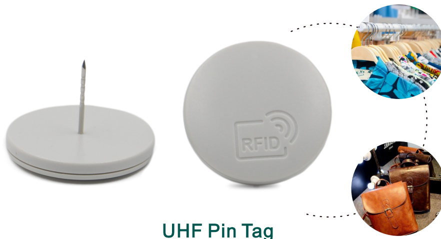
UHF Pin Tag

The RFID pin is a replacement of the traditional pin used with the EAS tag. It has a unique ID and can store additional information. It upgrades the EAS system, provides more advanced functions. It is encased with rough plastic, with the advantage of durable and reusable, offers cost-effective tagging solutions for industry customers and enables inventory visibility throughout the supply chain reducing shrinkage and out-of-stocks.